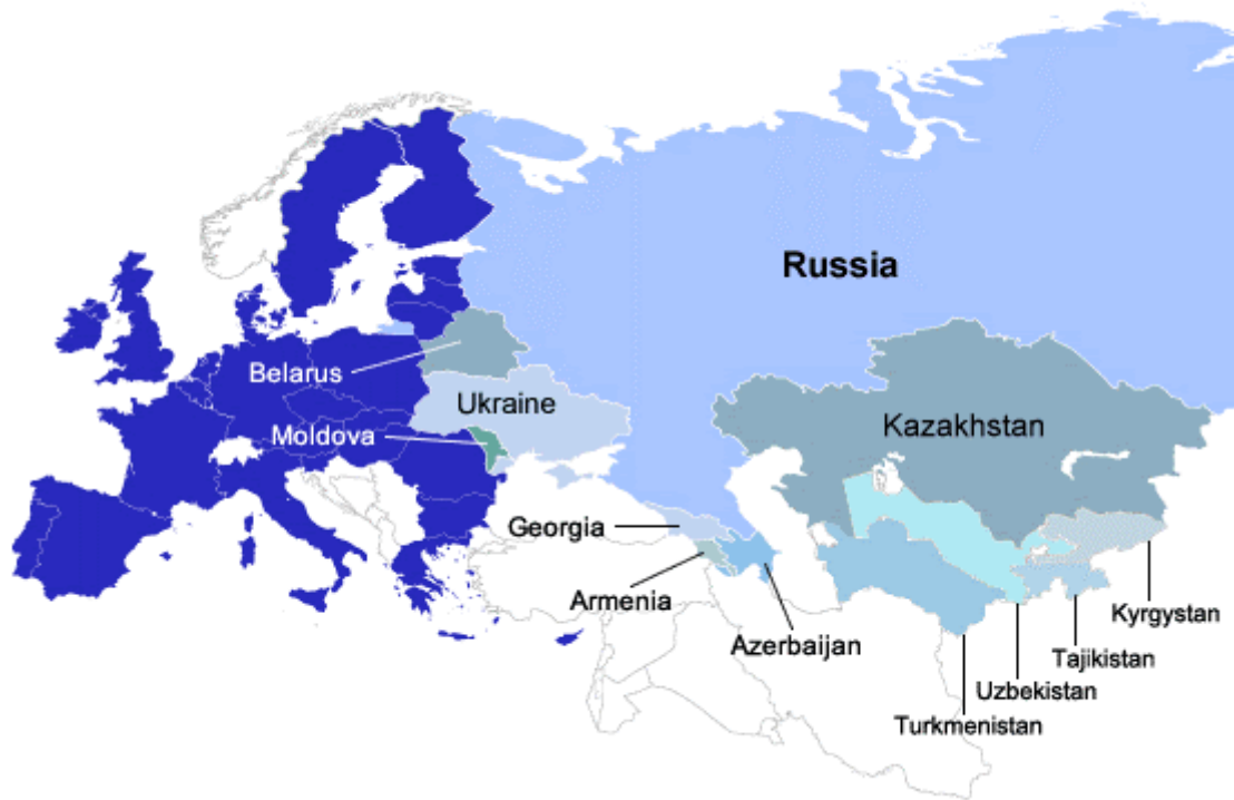
Figure 1: The ECA Region

For a more comprehensive analysis, the Eastern Europe and Central Asia region (ECCA region) is divided into three sub regions based on common ICT R&D features: